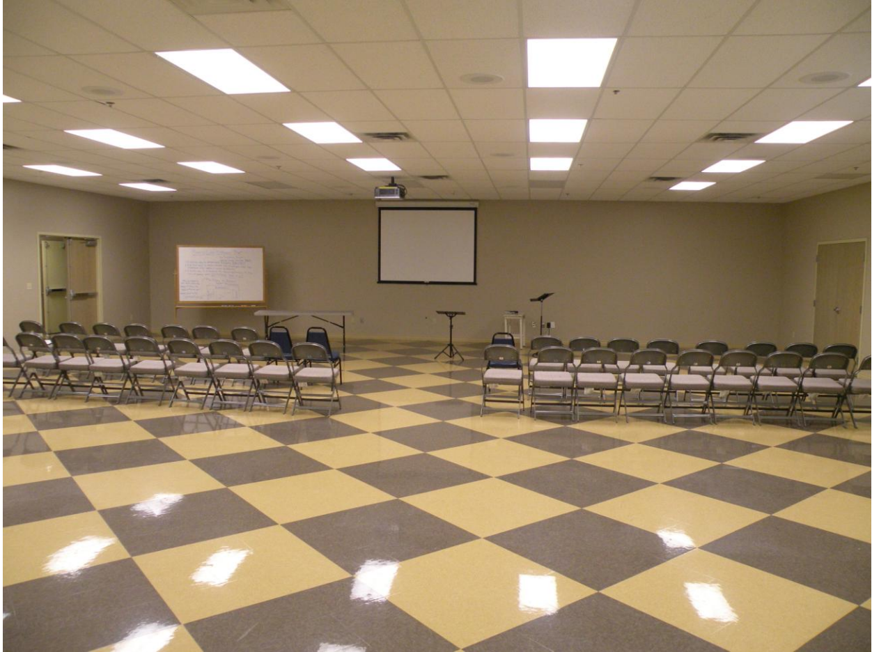
Fellowship Hall in new education wing.