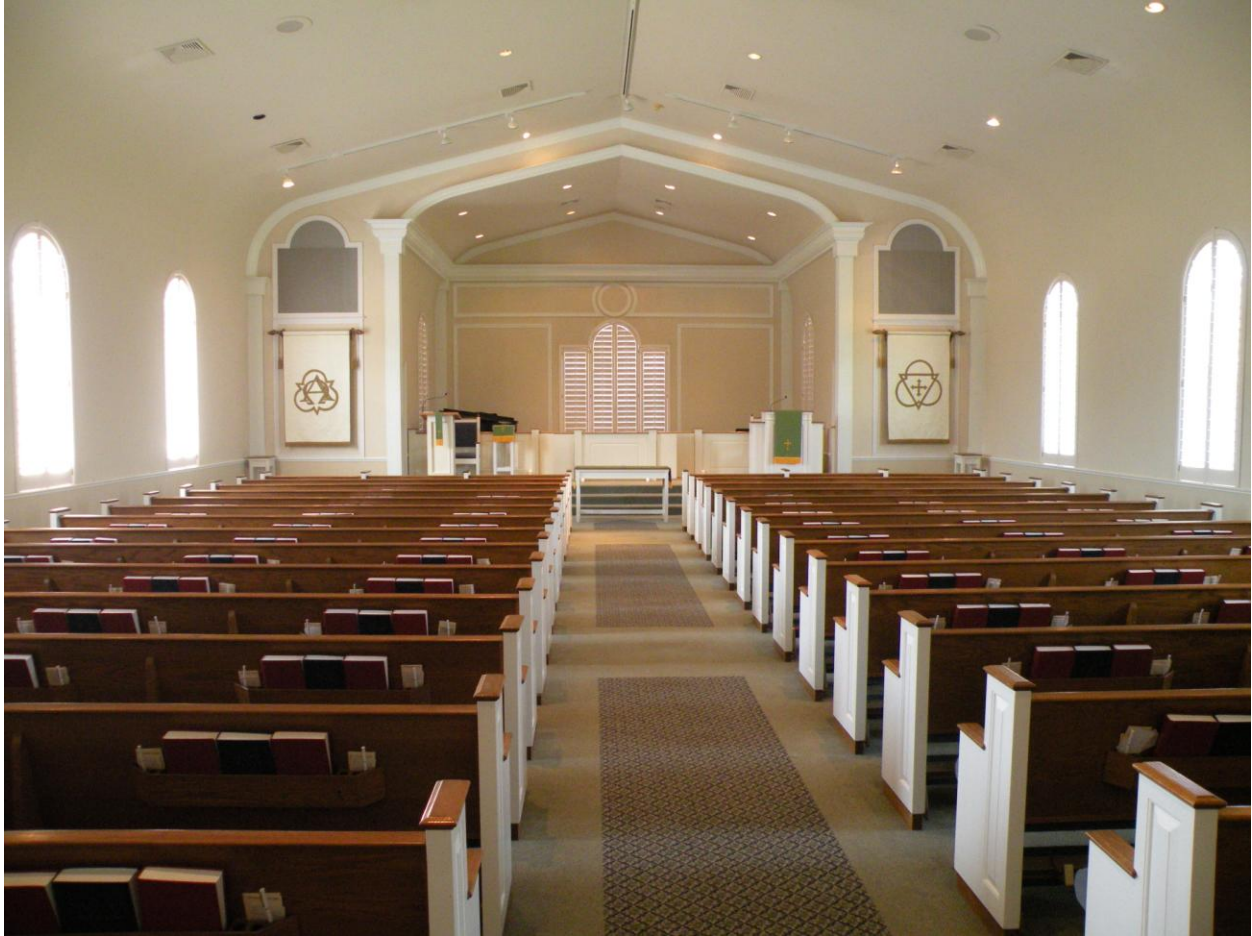
Inside view of sanctuary.