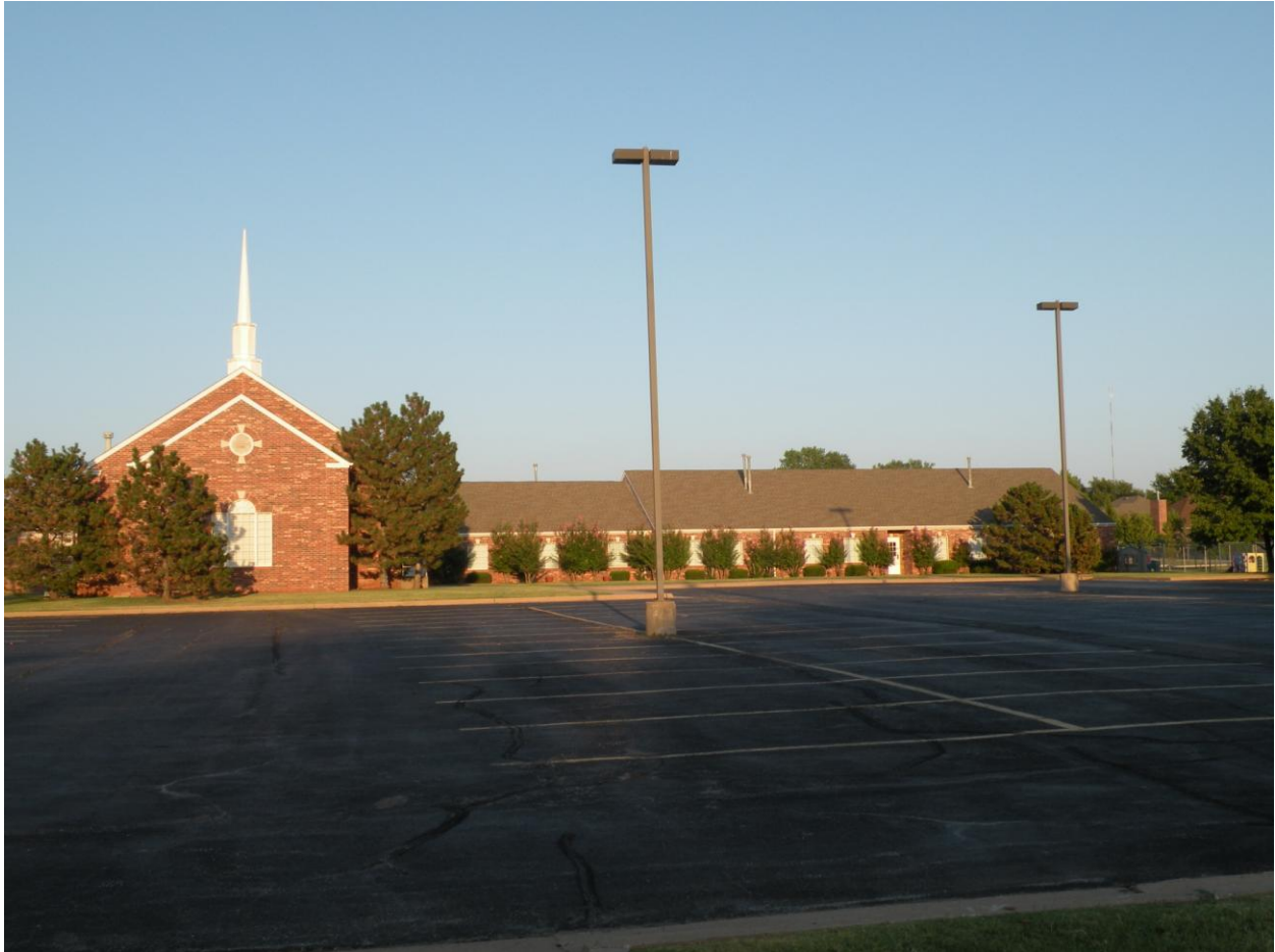
Front of building as viewed from Western Avenue.