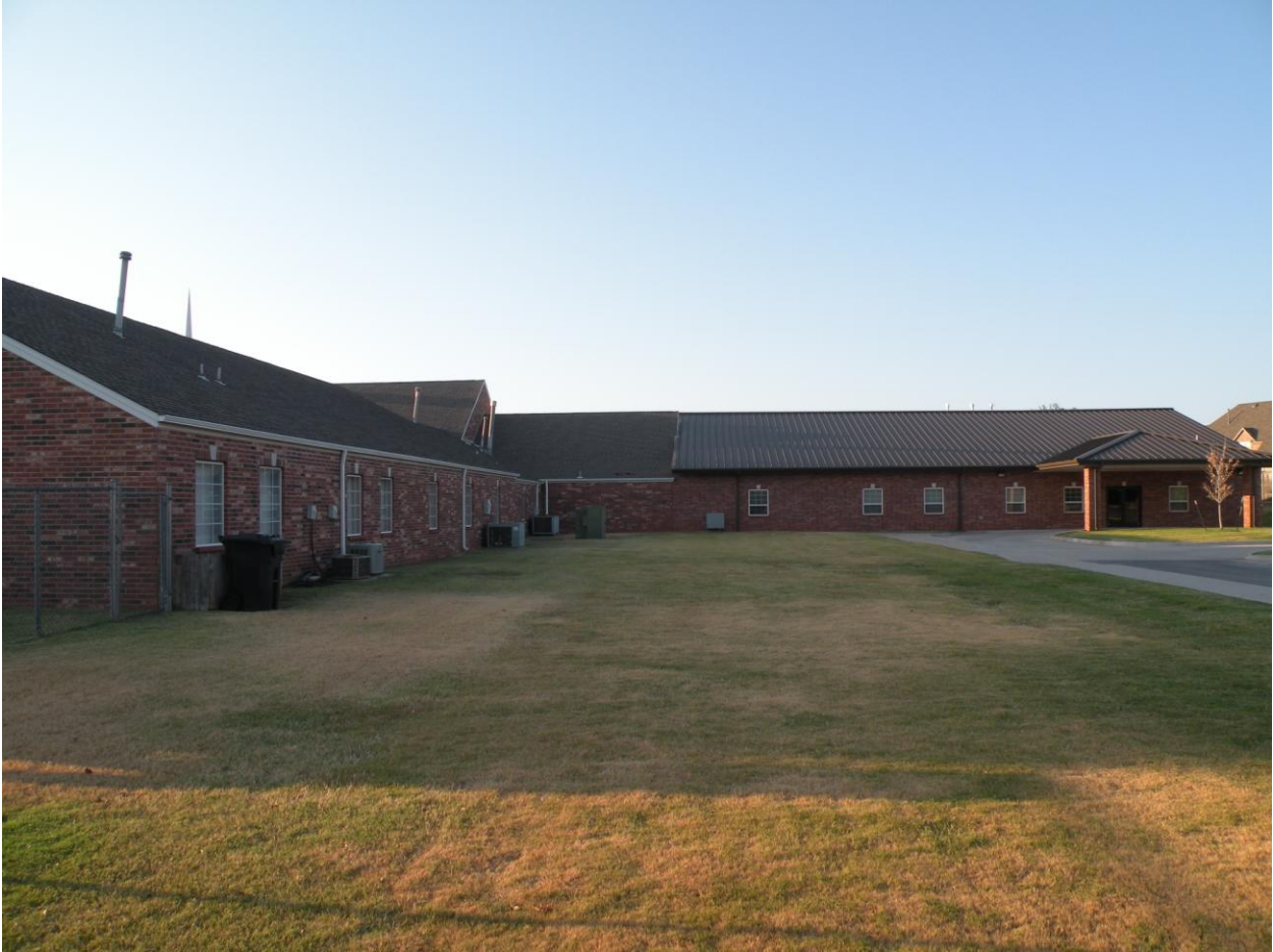
Rear entrance of building to new education wing.