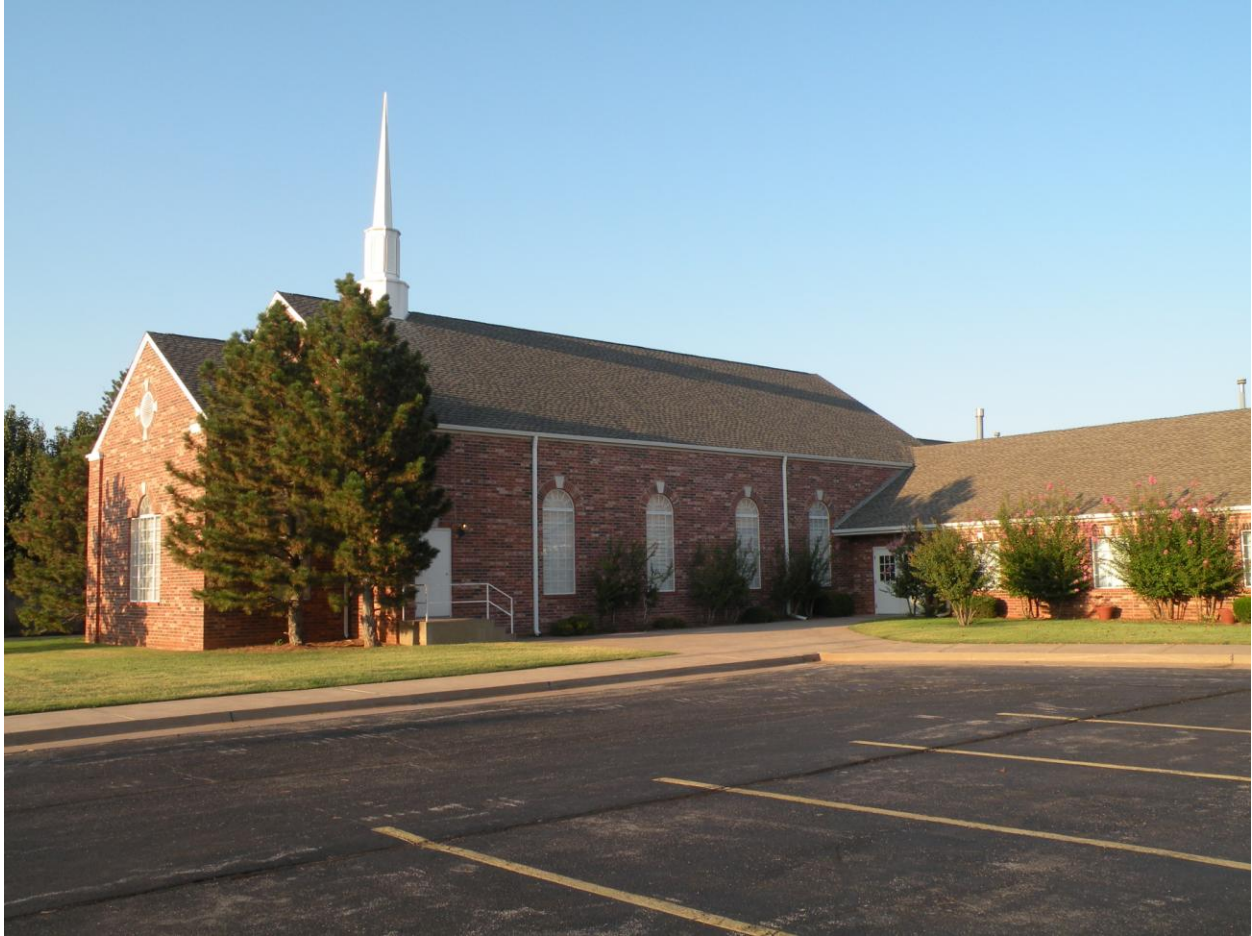
Side view of sanctuary and original education wing.